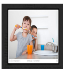
Figure 5. Suggestion for brushing teeth

for school children, namely: saliva pH, the amount of plaque, caries experience, utilization of dental health services, mother's behavior in selecting food for children, children's knowledge about dental health, children's behavior of dental health maintenance, children's behavior in selecting food; and the implementation of UKGS by teachers. 7 A'yun's Predictor Software has high sensitivity and specificity. This software is one of the new ways to describe the interaction of various factors that play a role in caries process APS was developed to create a better understanding of the multi-factorial aspects of dental caries for children and their parents, as well as to serve as a guideline in estimating the risk of new caries in school children. 8 This study aimed to determine the effect of APS on dental-oral health maintenance behavior, saliva pH, and PHPM index.