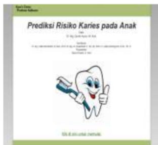
Figure 1. APS Program