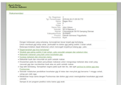
Figure 3. Suggestion and follow up of new caries prevention