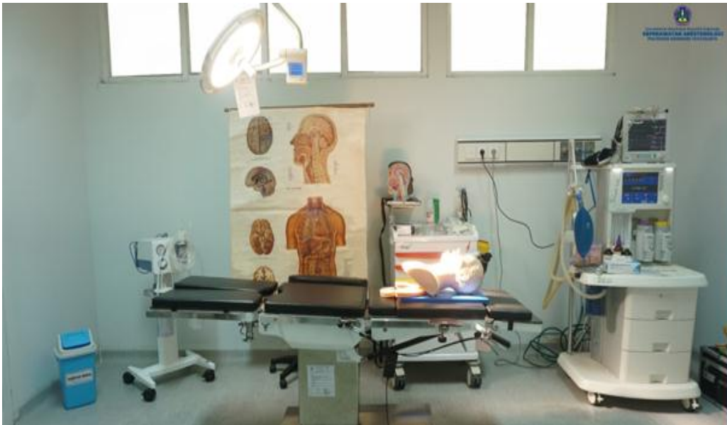
Figure 2. Setting of the neuroanesthesia operating room as a student learning media at the anesthesiology laboratory at Polkesyo