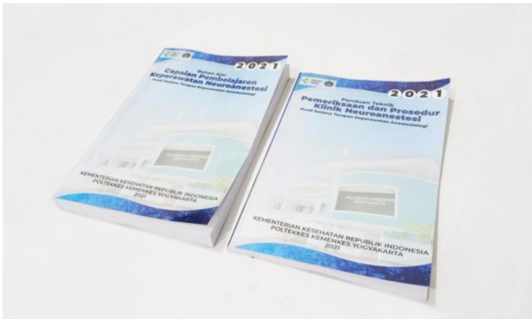
Figure 4. Guidelines for neuroanesthesia examination techniques and clinical procedures