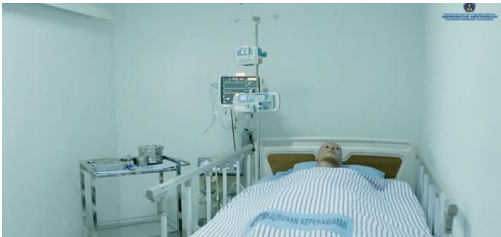
Figure 3. Neuroanesthesia post anesthesia lab room settings (recovery) at Polkesyo