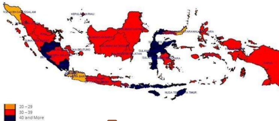
Figure 1. The severity of childhood stunting among children aged 6-23 months in Indonesia

follows: GDP was 10.10 \pm 8.81 billion, Gini ratio was 0.37 \pm 0.04 , perception corruption index (PCI) was 4.86 \pm 0.62 , poverty gap index (PGI) was 1.92 \pm 1.02 , severity gap index (SGI) was 0.49 \pm 0.36 , gender development index (GDI) was 64.62 \pm 3.82 , women empowerment index (WEI) 64.85 \pm 7.01 , Human development index 73.29 \pm 2.52 (HDI), tax ratio 11.9 \pm 5.78 , and health expenditure 3.1 \pm 0.51 .