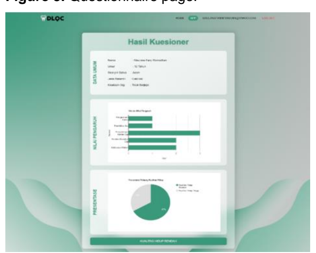
Figure 4. Results Page.