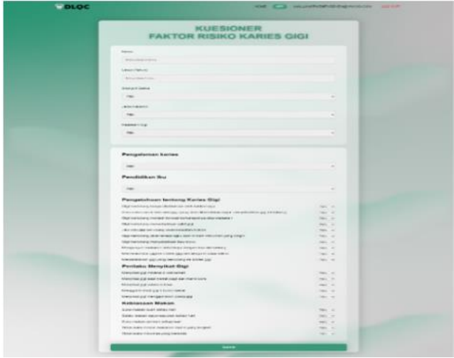
Figure 3. Questionnaire page.