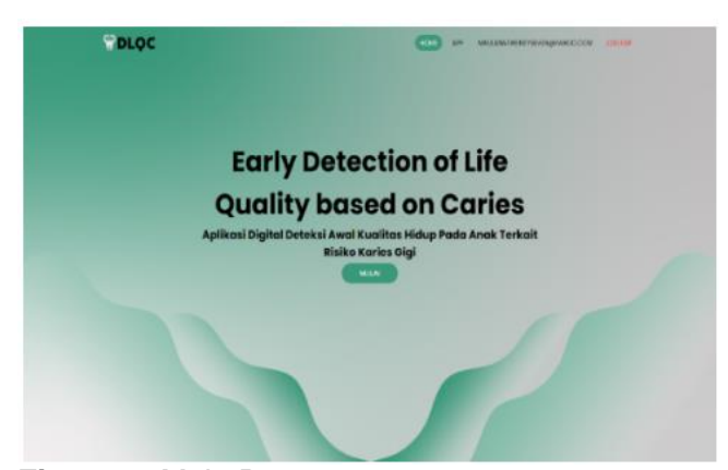
Figure 2. Main Page.

The appearance of the application website for early detection of quality of life in children related to the risk of dental caries is as follows: